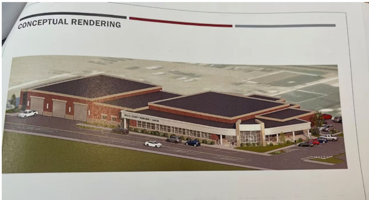
Wood County will be using 13 million dollars from its American Recovery Funds to build the multi-use building